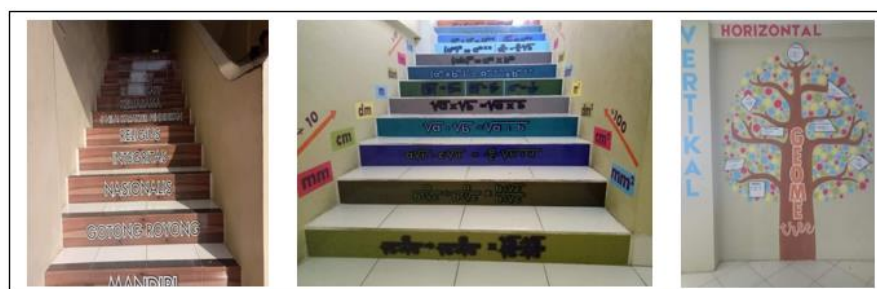
Figure 1. Literacy ladder and painting

To support the literacy movement, the school designed several public facilities and corners, such as writing numbers and noble value on the floor stairs, as in Figure 1.